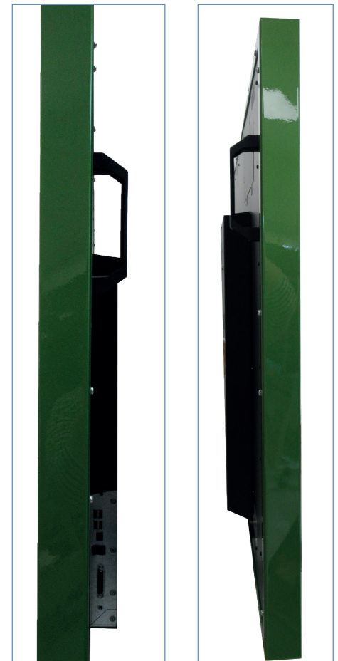
Backside of Brilan 4K 54.6, including glass protection frame in white