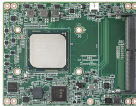
COM Express® Basic (125 x 95 mm)