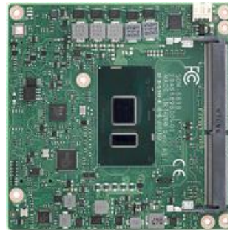
COM Express® Compact (95 x 95 mm)