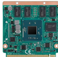
Qseven® (70 x 70 mm)