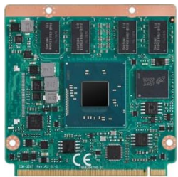
Qseven® (70 x 70 mm)