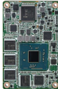
COM Express® mini (84 x 55 mm)