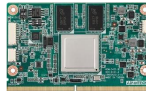
SMARC™ (84 x 55 mm)