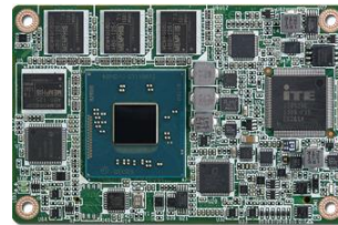
COM Express® mini (84 x 55 mm)