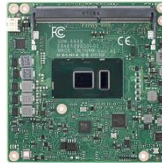
COM Express® Compact (95 x 95 mm)