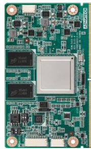
SMARC™ (84 x 55 mm)