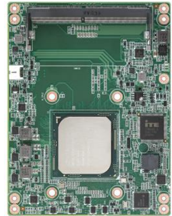
COM Express® Basic (125 x 95 mm)